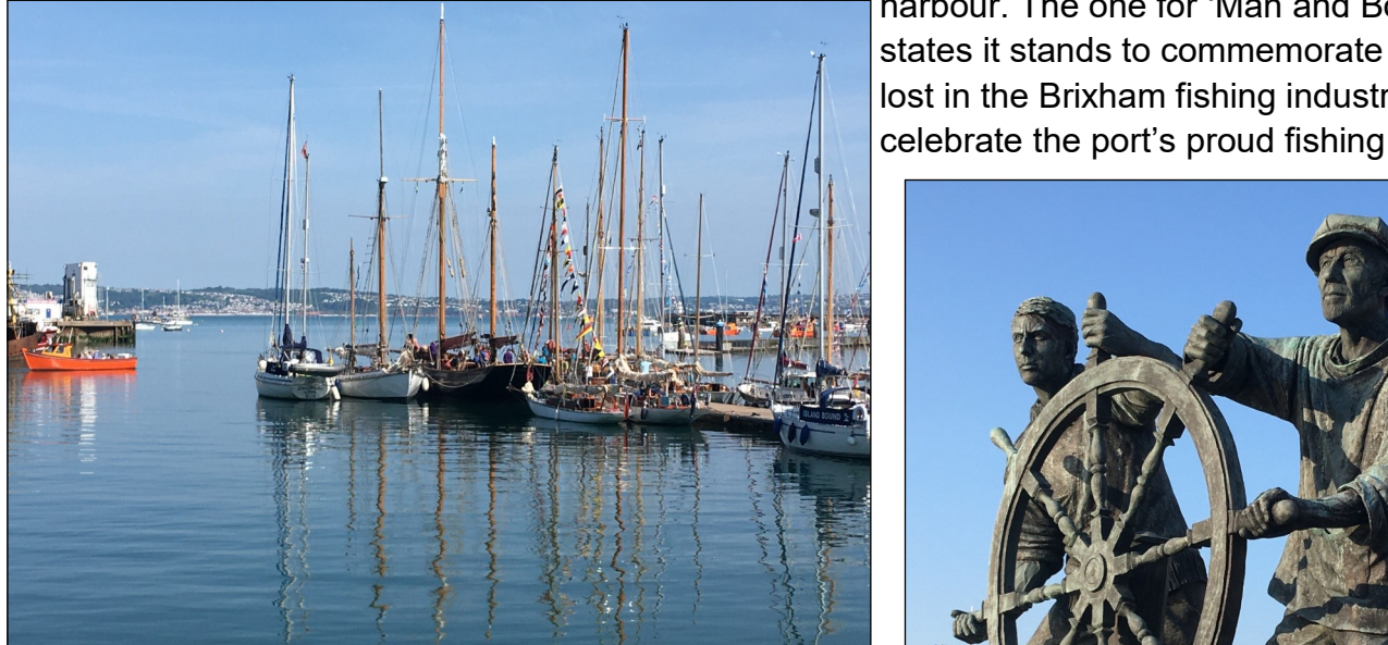
Part of the flotilla moored up

wheel. There were also several well done interpretation boards dotted around Brixham's pretty harbour. The one for 'Man and Boy' states it stands to commemorate lives lost in the Brixham fishing industry and to